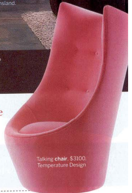
Talking chair, $3100, Temperature Design

For where to buy these brands or items, see page 157