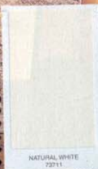
NATURAL WHITE 72711

These finishes work well grouped together: Oden weave, $99/metre, Crushed, $120/metre, Marco Fabrics. RIGHT Dulux (low sheen wash & wear) Natural White, from $61.90/4 litres, Bunnings Warehouse